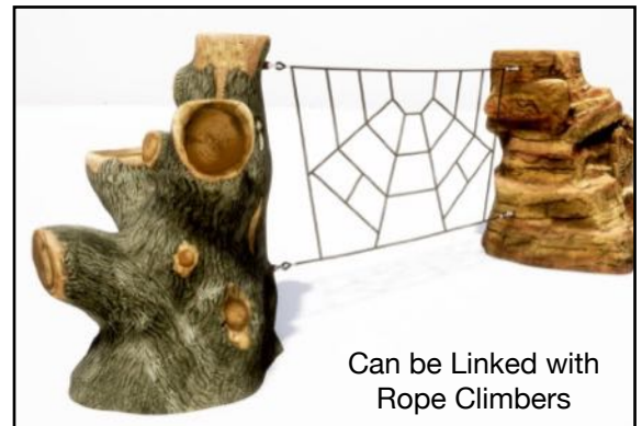
1000307 Big Oak Climber w/Rope Tabs

Modular Design Connects to various deck heights