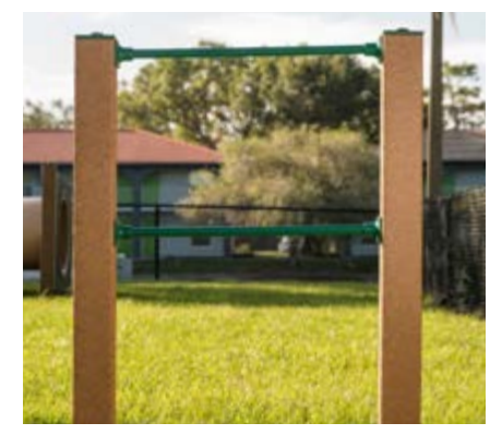
High Jump Model: RECF0011XX Weight: 128 lbs. $598