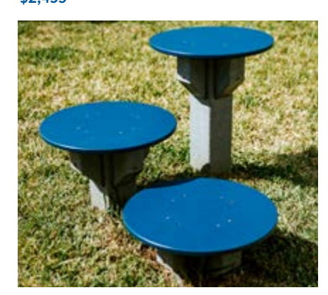
Step Up Model: RECF0005XX Weight: 154 lbs. $1,243