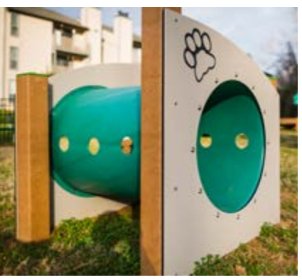
Dog Log Model: RECF0008XX Weight: 400 lbs. $1,960