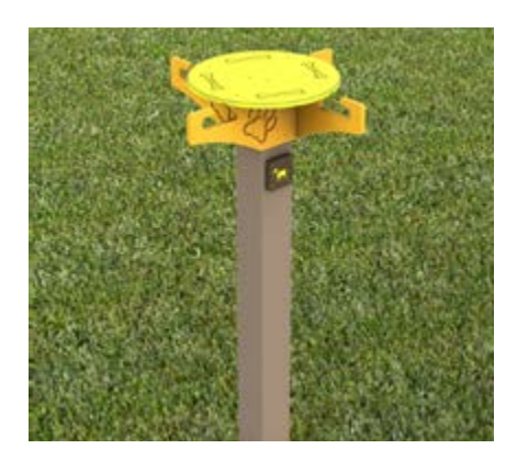
Leash Holder Model: RECF0022XX Weight: 70 lbs. $566