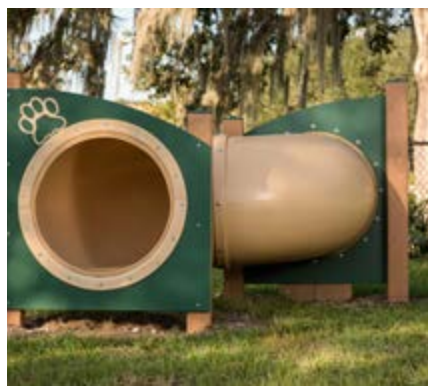
Through the Tunnel Model: RECF0004XX Weight: 420 lbs. $2,455