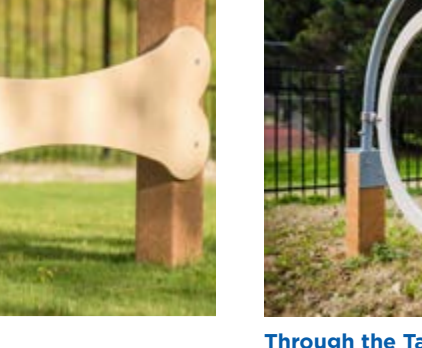
Through the Target Model: RECF0006XX Weight: 112 lbs. $846