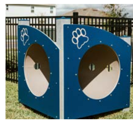
Nice Turn Model: RECF0013XX Weight: 331 lbs.