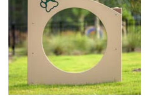
Jump Through Model: RECF0014XX Weight: 147 lbs. $720