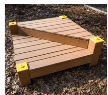
Climb and Sit Model: RECF0002XX Weight: 296 lbs. $1,541