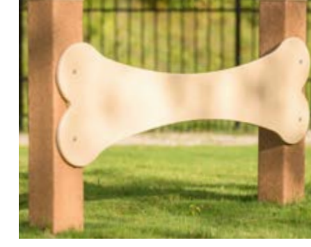
Over and Under Model: RECF0012XX Weight: 109 lbs. $470