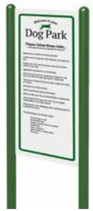
Welcome/Rules Sign 24" L x 4" W x 78" H, 77 lbs. $615