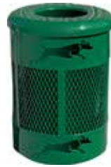
Trash Receptacle 30"H x 22W", 102 lbs. $968