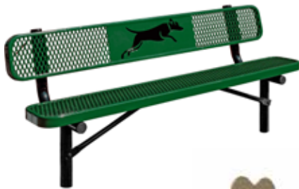
6-foot Bench (in-ground mount) 72" L x 26" W x 30.46" H, 150 lbs. $988