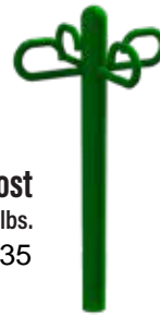
Leash Post 23" L x 23" W x 39" H, 26 lbs. $435