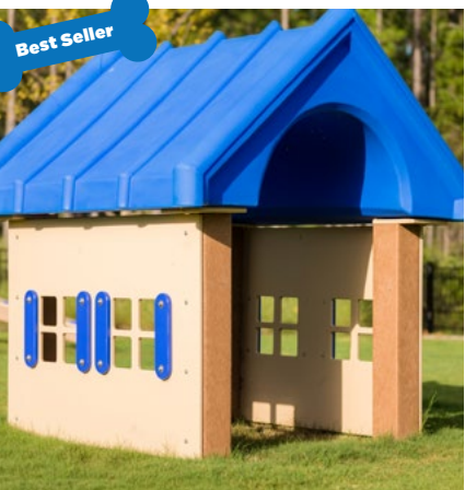
$2,566 HOME SWEET HOME RECFO010XX