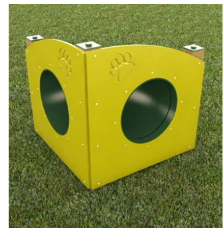
$2,031 NICE TURN RECFO013XX