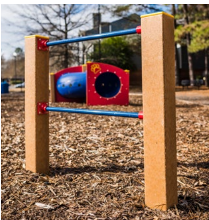
$655 HIGH JUMP RECFO011XX