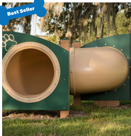
$2,688 THROUGH THE TUNNEL RECFO004XX