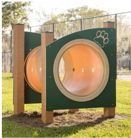
$2,146 DOG LOG RECFO008XX