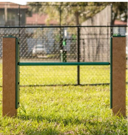
$694 LIMBONE, ANYONE? RECFO003XX