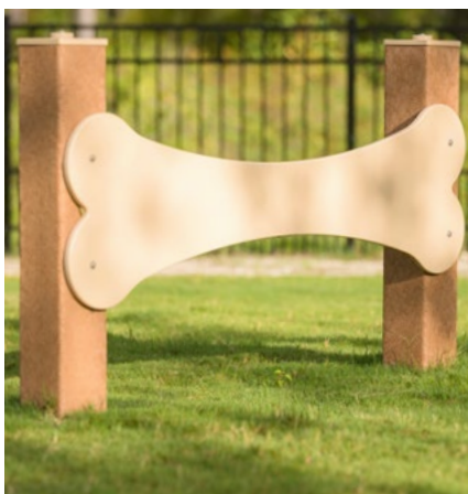
$515 OVER AND UNDER RECFO012XX