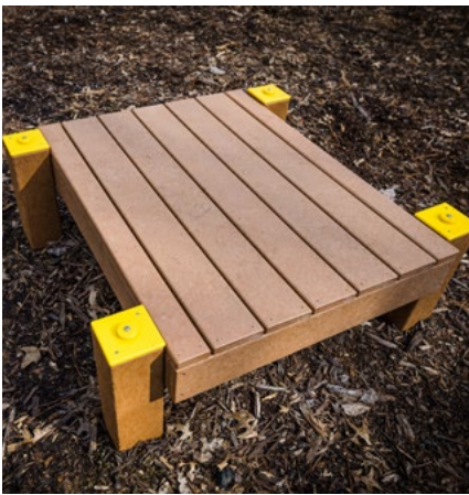
$1,227 LET'S REST RECFO009XX