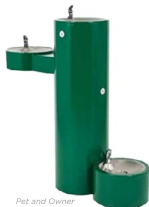
Pet and Owner

Pet Drinking Fountains: Pet & Owner - BSW-0007XX $4,537 Pet Only - BSW-0010XX $4,537