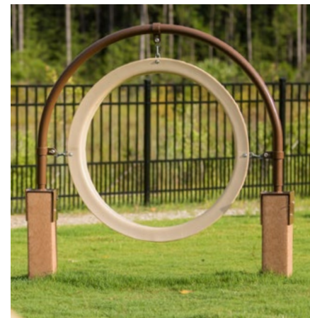
$926 THROUGH THE TARGET RECFO006XX