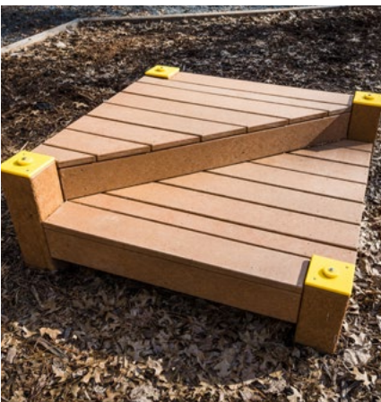
$1,687 CLIMB AND SIT RECFO002XX