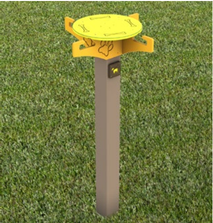
$620 LEASH HOLDER RECFO022XX