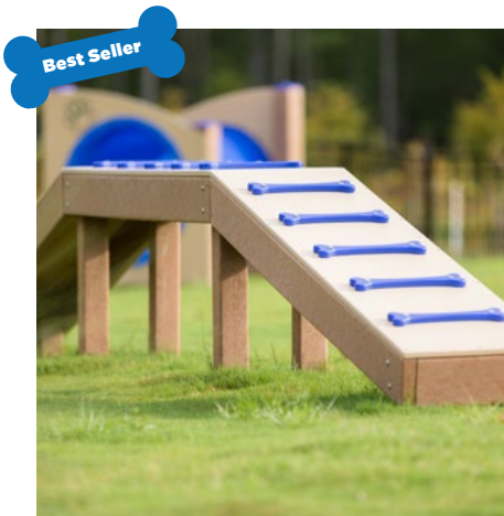
$2,675 WALK THE PLANK RECFO015XX