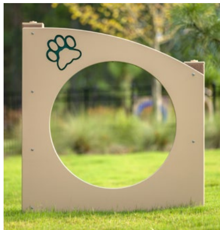
$788 JUMP THROUGH RECFO014XX