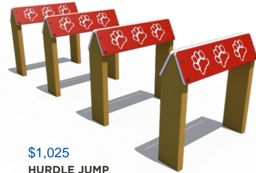
$1,025 HURDLE JUMP RECFO007XX