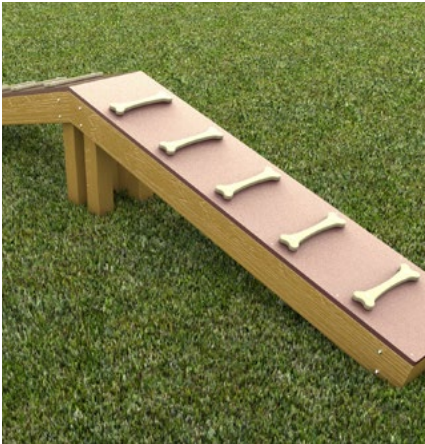
$2,019 CAMEL HUMP CLIMBER RECFO001XX1