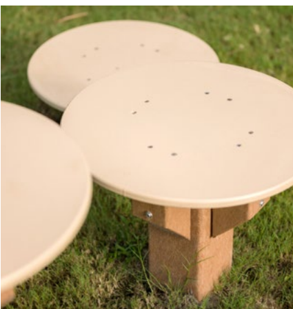
$1,361 STEP UP RECFO005XX