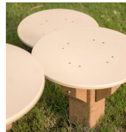
$1,688 STEP UP RECF0005XX