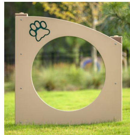
$978 JUMP THROUGH RECF0014XX