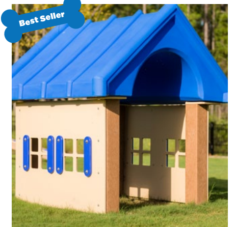
$3,182 HOME SWEET HOME RECF0010XX