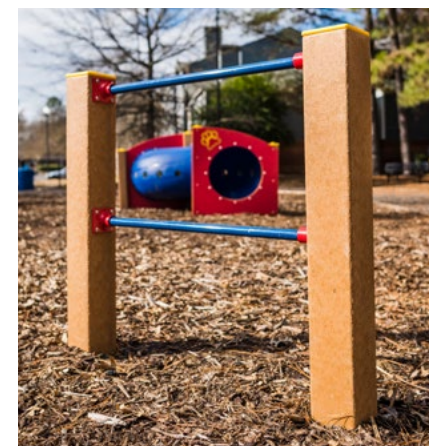
$813 HIGH JUMP RECF0011XX