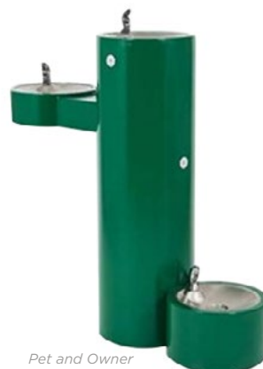
Pet and Owner