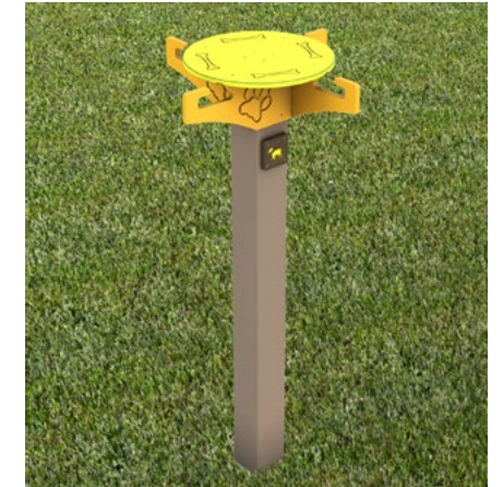
$769 LEASH HOLDER RECF0022XX