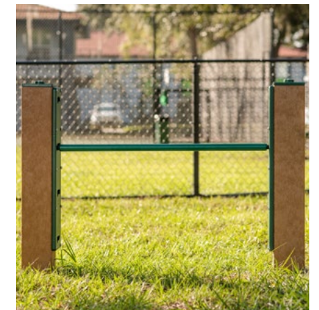
$861 LIMBONE, ANYONE? RECF0003XX