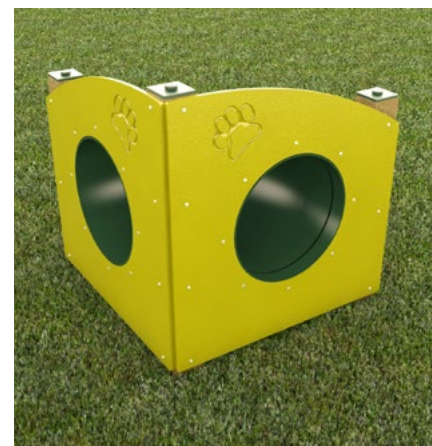
$2,519 NICE TURN RECF0013XX