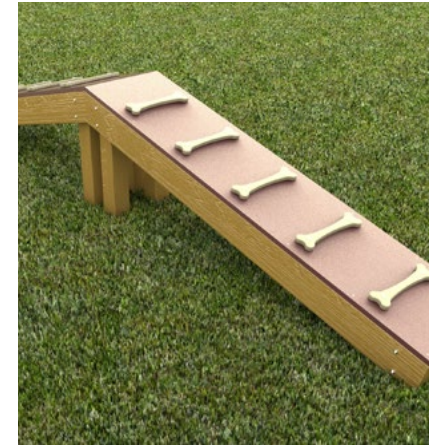
$2,504 CAMEL HUMP CLIMBER RECF0001XX1