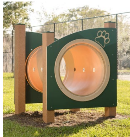
$2,662 DOG LOG RECF0008XX