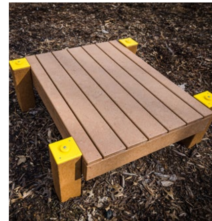
$1,522 LET'S REST RECF0009XX