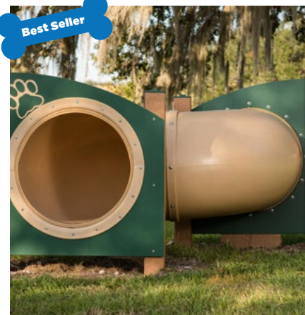
$3,334 THROUGH THE TUNNEL RECF0004XX