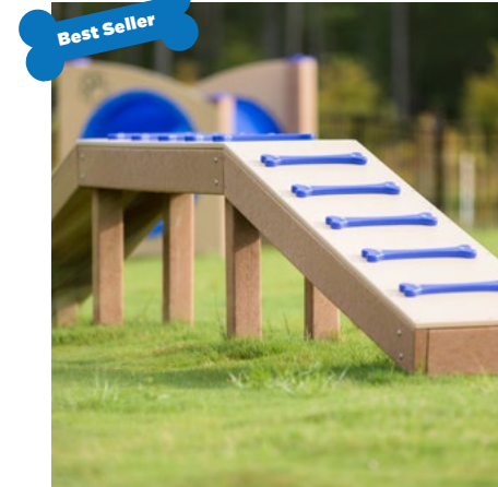
$3,317 WALK THE PLANK RECF0015XX