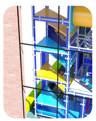
6 Level Deck Climb