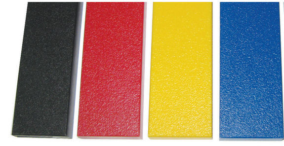
Black, Red, Yellow, Blue, Green, & Tan