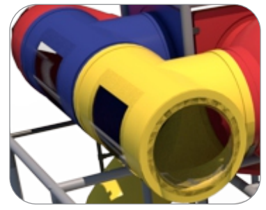
8' T-Tube Crawl Tunnel with Lookout Windows