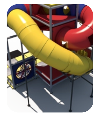
9' Enclosed Curved Tube Slide