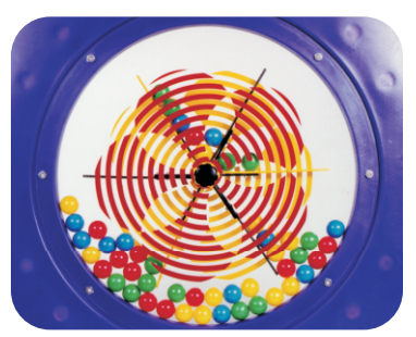
Ball Turn Activity Panel Toddler Activity