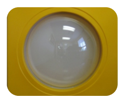
Bubble Lookout Panel