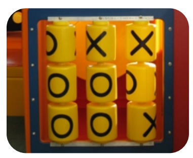
Tic-Tac-Toe Activity Panel Toddler Activity