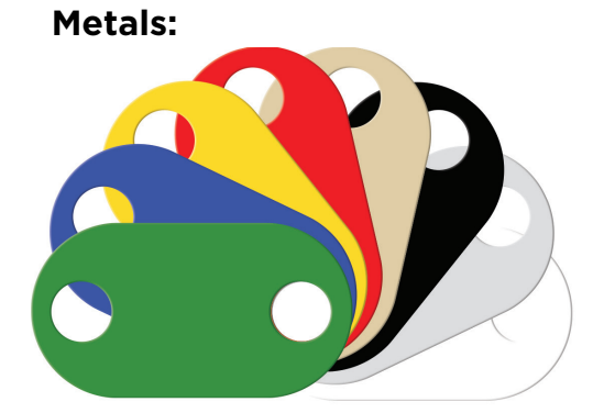
Green, Blue, Yellow, Red, Tan, Black, Silver & White