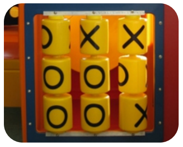
Tic-Tac-Toe Activity Panel Toddler Activity