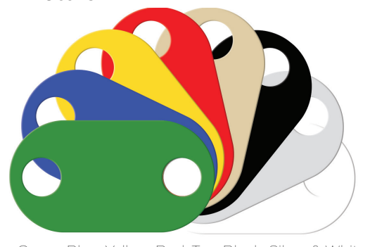
Green, Blue, Yellow, Red, Tan, Black, Silver & White