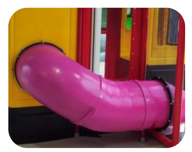
6' Enclosed Curved Tube Slide