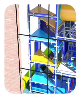
4 Level Deck Climb