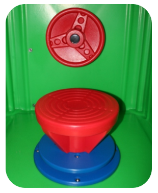
Twist 'N Turn Seat with Steering Wheel