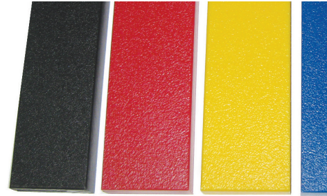
Black, Red, Yellow, Blue, Green, & Tan