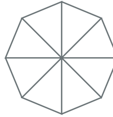
Fiberglass Frame 8 Panels