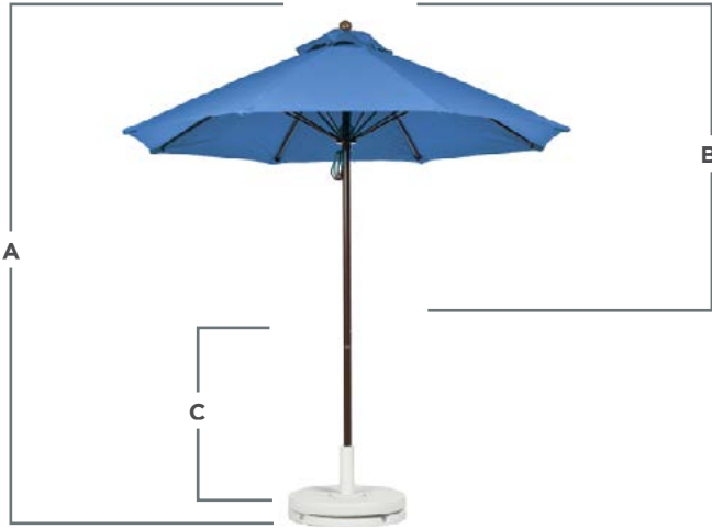
7.5' Octagon 7.5UMB-MRKT-FG